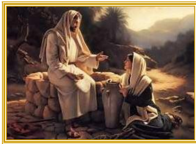
“The Jesus Touch”

A step-by-step program used in combination with CAA Ministries’ Web Based Outreach-Link program.